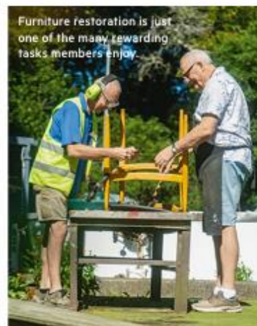
Furniture restoration is just one of the many rewarding tasks members enjoy.