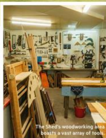
The Shed's woodworking area boasts a vast array of tools.

If you're involved in a community shed, contact the activities organiser at your local Bunnings store to organise a sausage sizzle fundraiser.