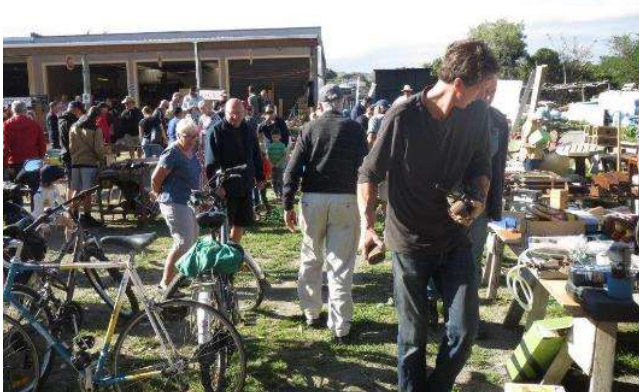
This guy bought so much stuff. Hope he donates it next year!