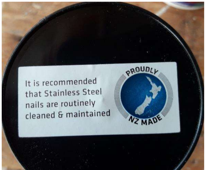
Label on a box of NZ made stainless steel nails.