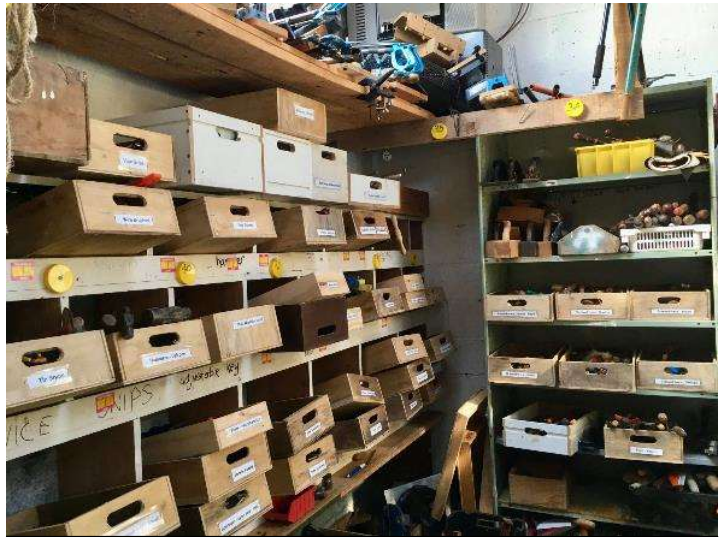
Above - Sorted tools in the tool store.