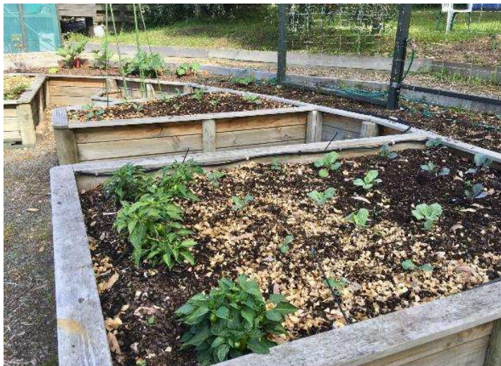
Planter beds set for Winter.