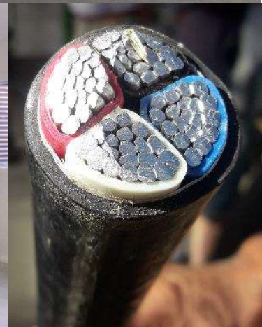
The new 3 phase incoming cable provided free by Electra,