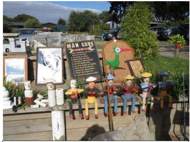
Everything was for sale