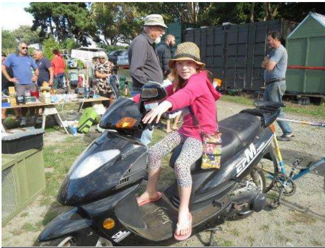
Even the motorbike went – not to her though!