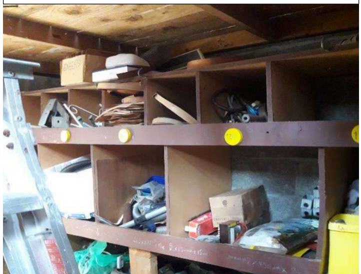
Below – yet to be sorted.