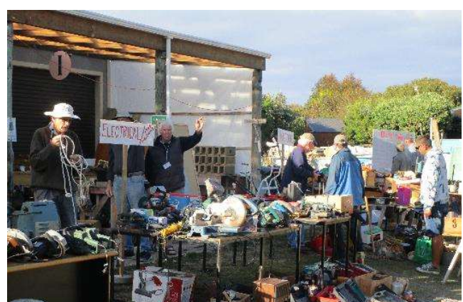
Name your price and it's yours