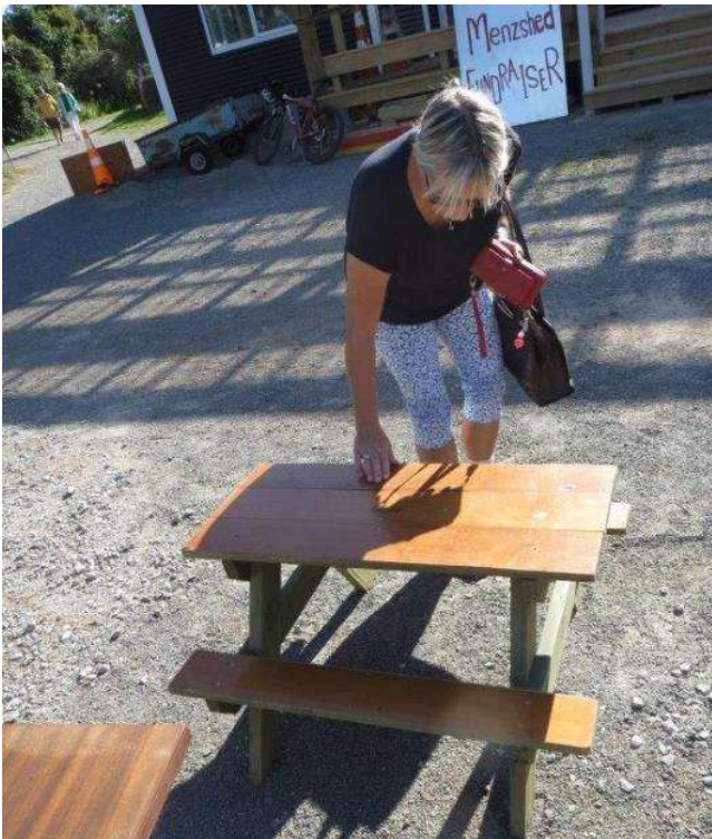
Unfortunately our model bench table sold by accident.