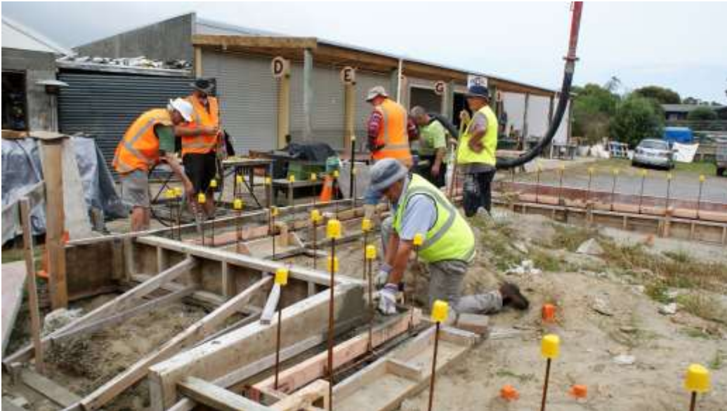
The team leaps into action with trowels, vibrators and shovels at hand