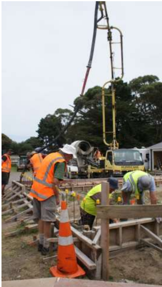
The concrete under control of the experts...