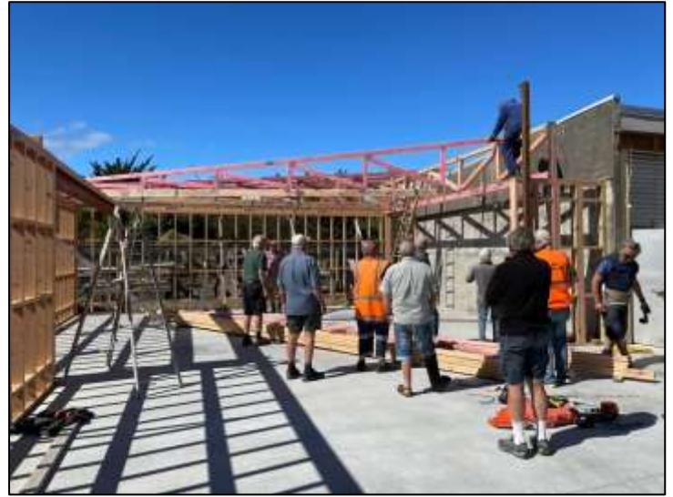
Roof trusses up and the erection gang admiring their work.