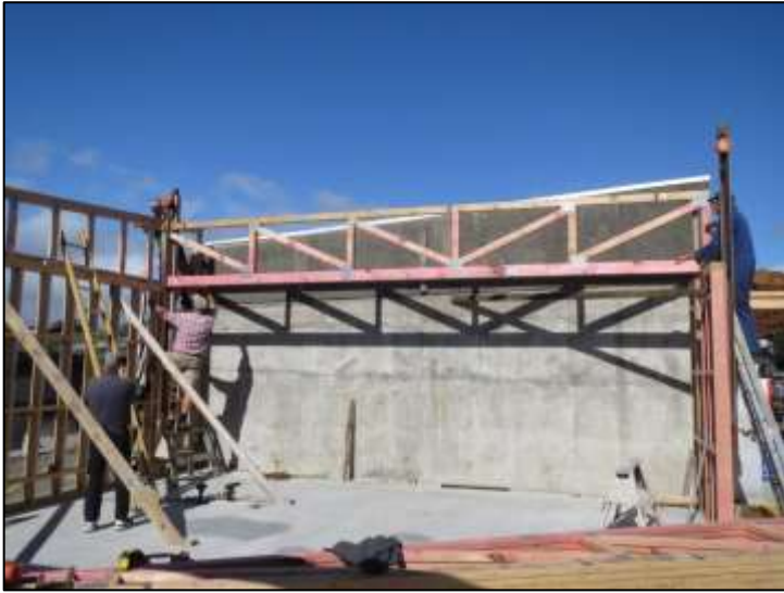
End beam going up to support the roof trusses next the garages.