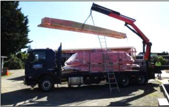
The wall and roof framing arrived on one truck and the driver, with a Palfinger crane, unloaded it himself.

The floor slab was poured in January and then apart from a few small but essential jobs all we could do was wait for the delivery of the framing. The wall and roof framing arrived early March and the construction team set about erecting it. Here are a few pics of the process.