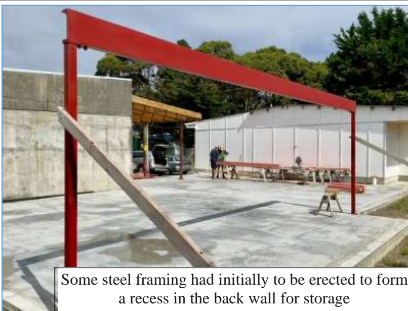
Some steel framing had initially to be erected to form a recess in the back wall for storage

To Commemorate Prince Andrew The Royal Mint Are Releasing A Limited Edition 50 Pence Coin