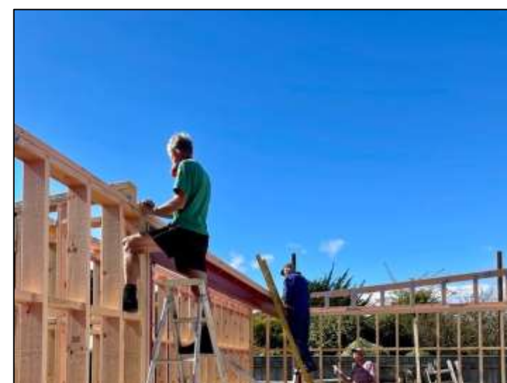
Back wall, which had to be attached to the steelwork