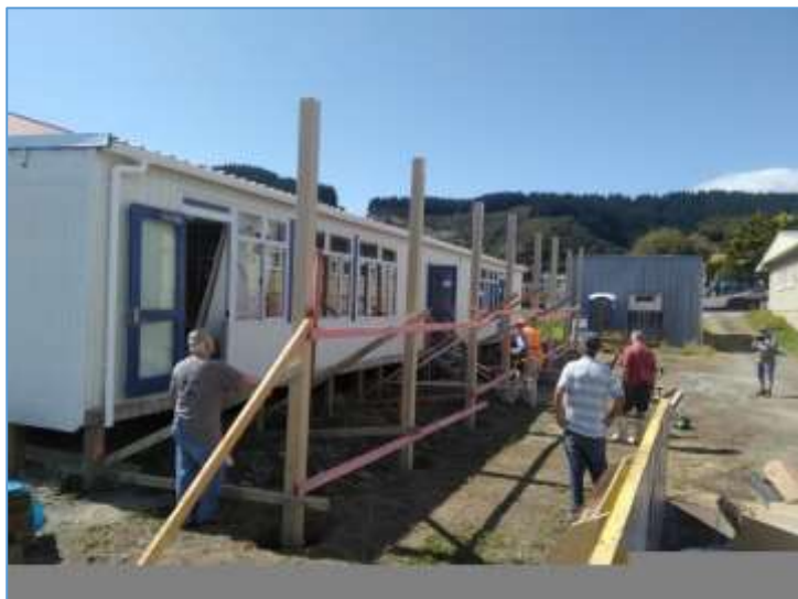
The Food bank frontage before and after, the deck is well underway