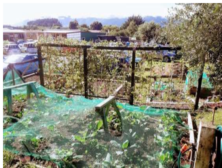
An overview of the garden from where they can keep an eye on happenings at the Shed