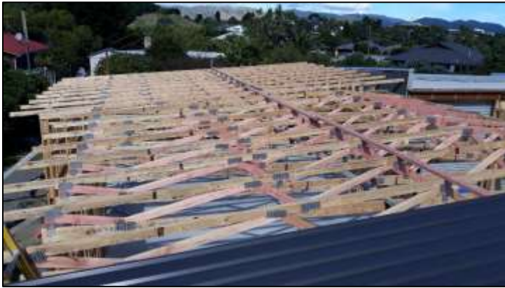
The rooftop from above now that all the roof framing is in