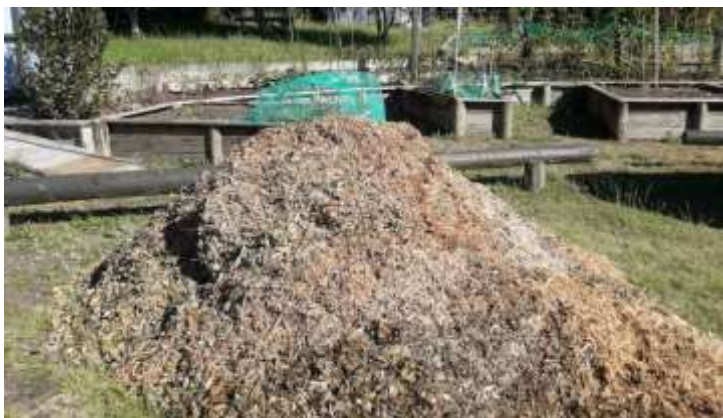
A load of wood chippings for the garden curtesy of Alan M