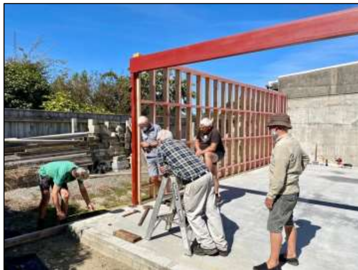
Back wall being erected, hope the garage wall was plumb and note the attention to detail, how the steps had to be held in place in case they wandered off!