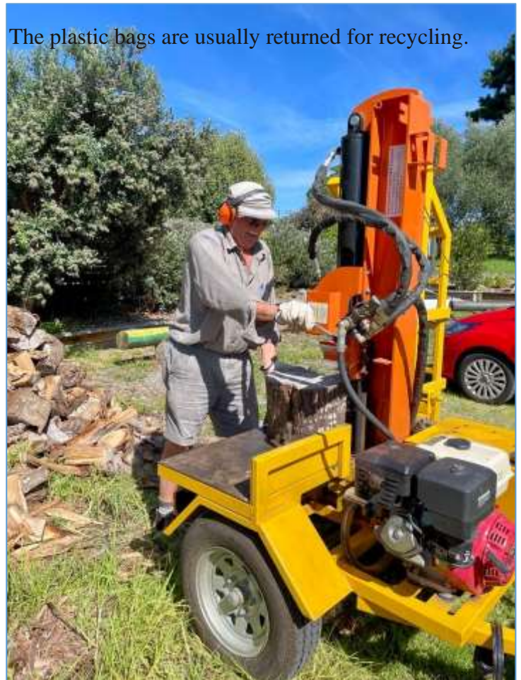
The plastic bags are usually returned for recycling.