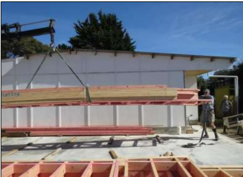
The roof framing came off first so had to be stacked separately from the wall framing