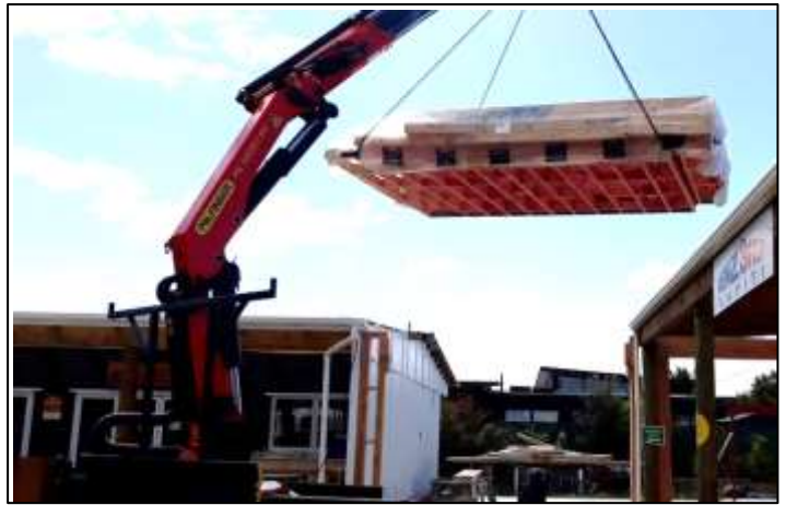
It was a tight squeeze getting it over the Amenities roof and next the garage