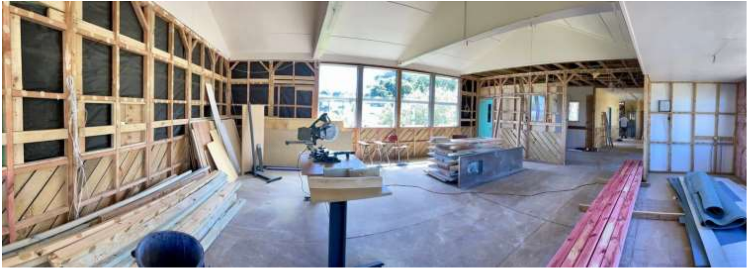
The main internal room, just longing for gib!