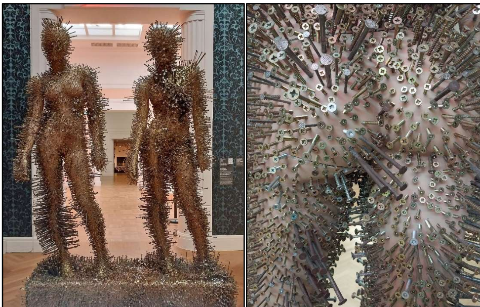
A possible new option for storing the plethora of screws and nails available in the store. - Volunteers wanted!