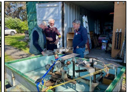
At last the engraving machine is going!