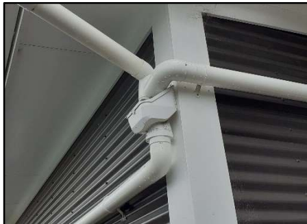
A right tangle of pipes!