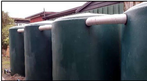
The interlinked tanks