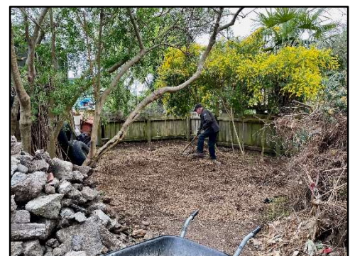
A hidden garden at the shed?