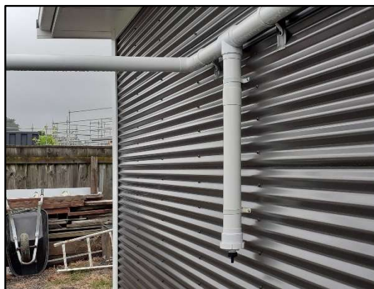
Diverted pipes going along the building past the first flush diverter and across to the tanks.

The first flush diverter takes the initial roof discharge containing leaves, bird poo etc and diverts it away from the tanks.