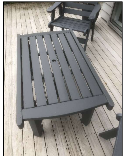
You can't even see what was wrong! Allan C replaced and replaced a rotten board and it just looks like a new one!