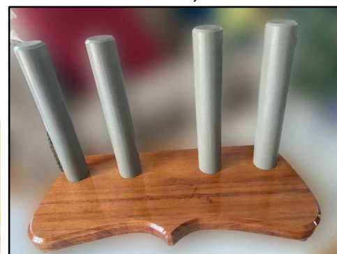
"Grandad could you please make me a gumboot stand?"