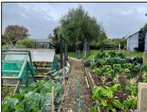
The bountiful state of the garden