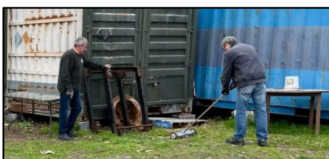
The search for the missing screw continues.