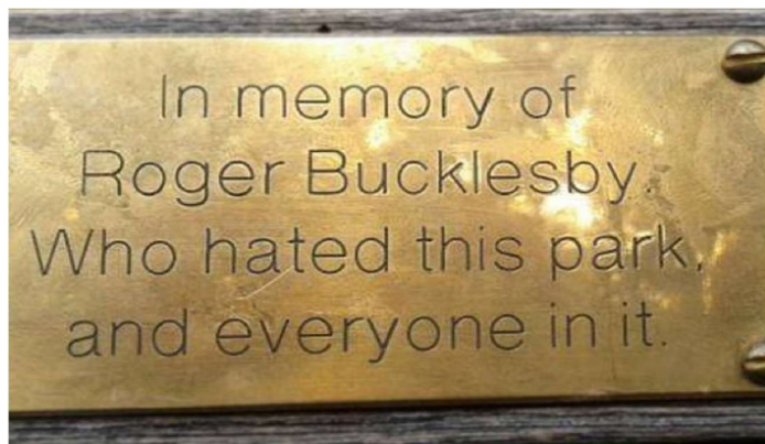
From a park bench in the UK – see there is a way to get your revenge and be remembered!