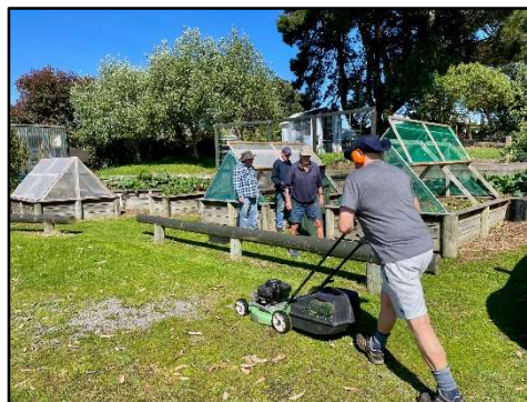
Oh it all makes work for the working man today