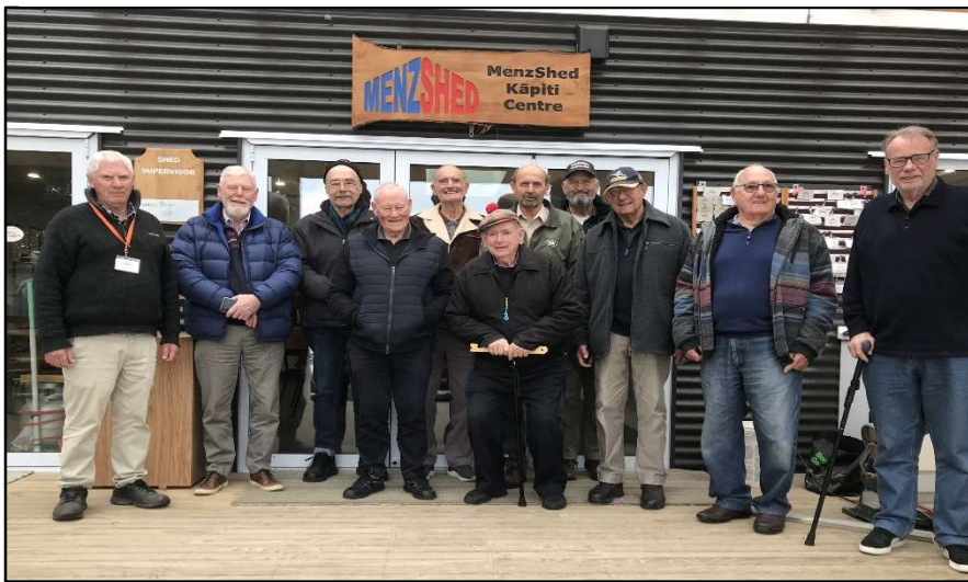
Visitors from Summerset village came to have a look at us.