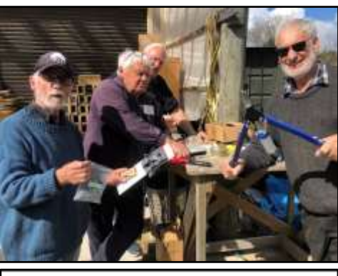
Ratters trying out the new rivet gun