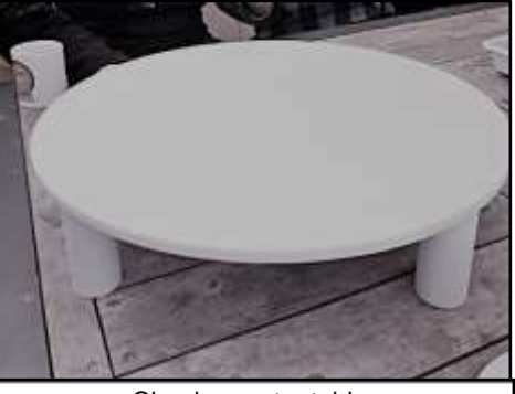
Circular pastry table