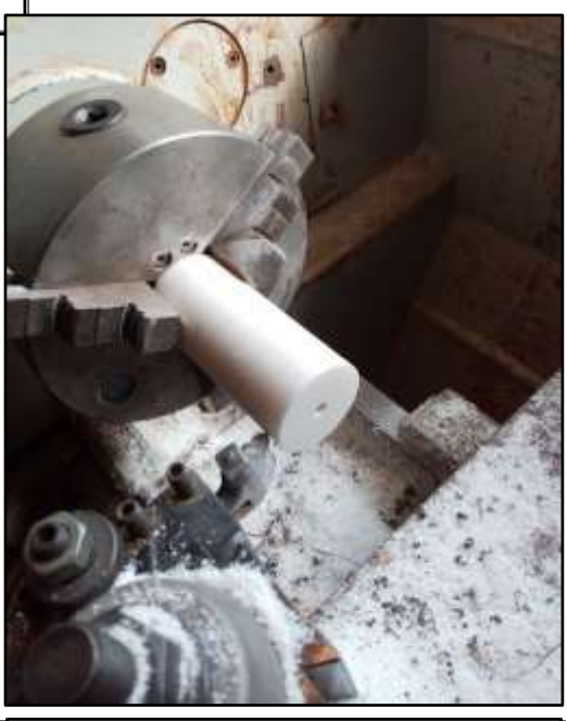
Turning the legs of the pastry table