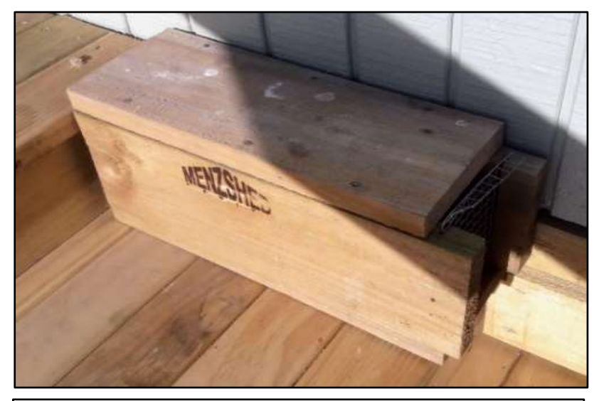
One of our ratters' traps set by the Foodbank, unfortunately it's set so the rats can't get into it. Will save having to change the bait!