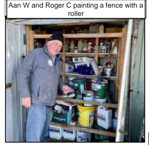
Have we got any Half Akaroa - you know sort of off-white, or is it a mud colour?