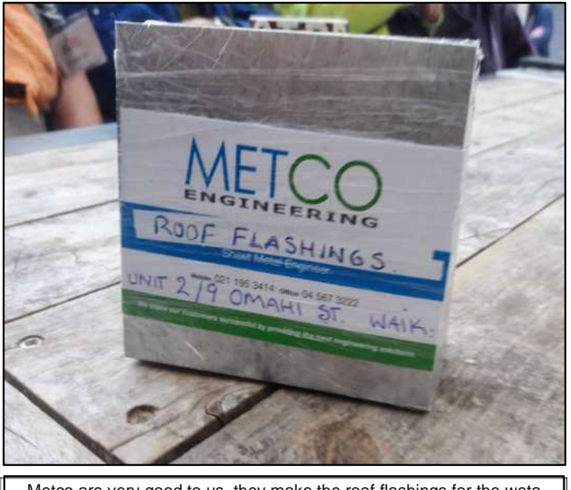
Metco are very good to us, they make the roof flashings for the weta motels from their roofing offcuts