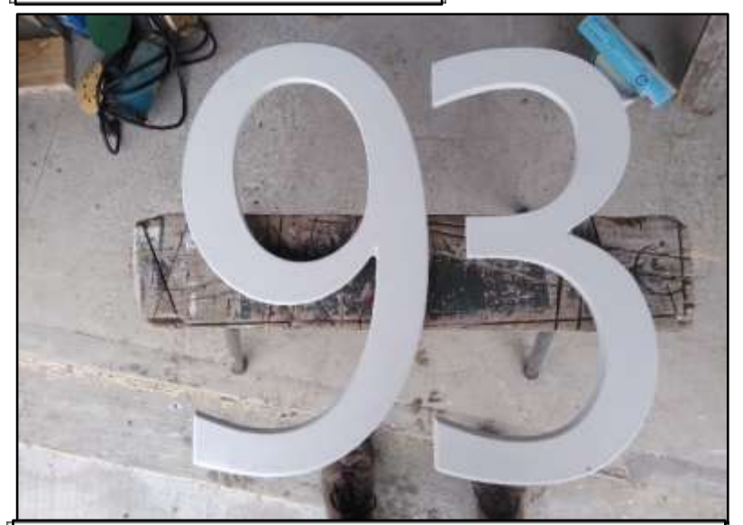
Some projects require lateral thinking, or some call it cheating, and the request for two large numbers out of wood had Mark K testing out his new (expensive) toy at home i.e a CNC Router and the end result is very impressive as was the short video on his phone showing it in operation.

Dementia Test Answer to Question 2 & Question 3