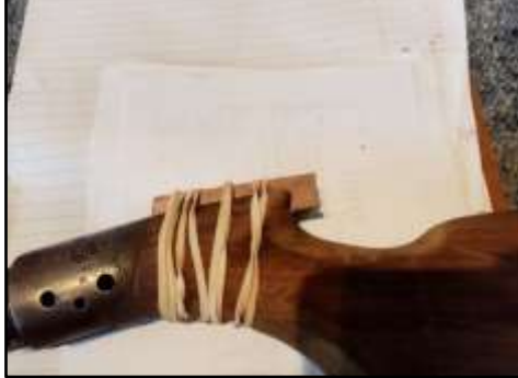
The stock of Barry's rifle had some rot in it so we cut it out and glued in a piece of matching walnut.