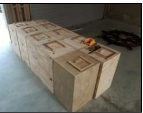
Set of 10 kiwi boxes, in total we made 16