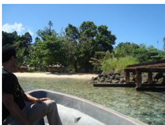
Crossing Buka Strait