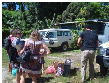
Toolbox and team loading for Chabai