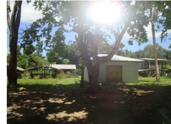
Part of the Chabai compound

Thanks to NZ Police who enabled me to travel with them from Buka to Chabai to deliver the toolbox. They were there to prepare for a Family Violence Course to be run that week.